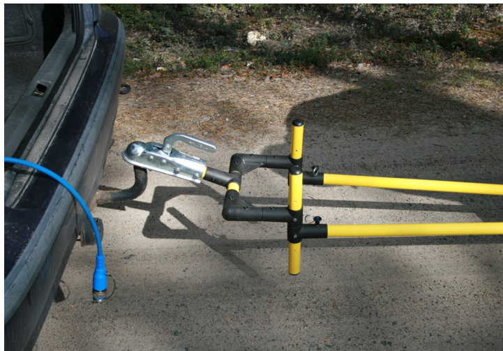
Attach the trailer coupler to the hitch ball