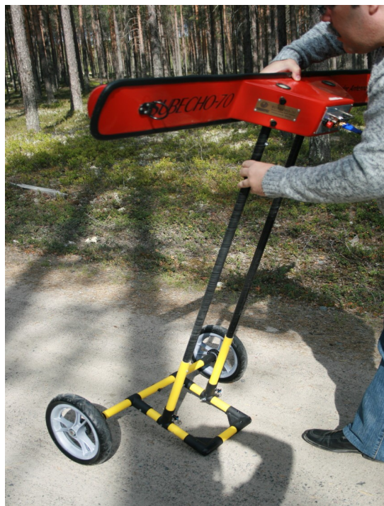
Insert the antenna into the antenna holders