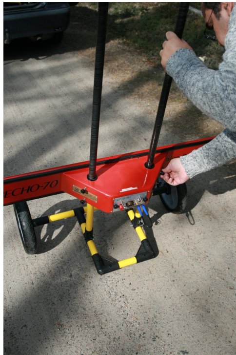
Fasten the antenna to the antenna holders