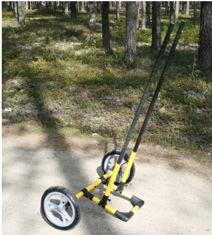
Rear part with antenna holder ready for antenna insertion